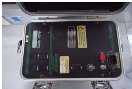
Figure 3. RAD-7™ electronic continuous radon monitor.

cell is filled with air by the technique of a small pump that draws the air into this cell one time in each pre-selected interval. In aforementioned cell, the radon may disintegrate, and the disintegrations are counted. This cycle will be repeated throughout [17]. Figure (3) shows the RAD-7™ electronic radon monitor.